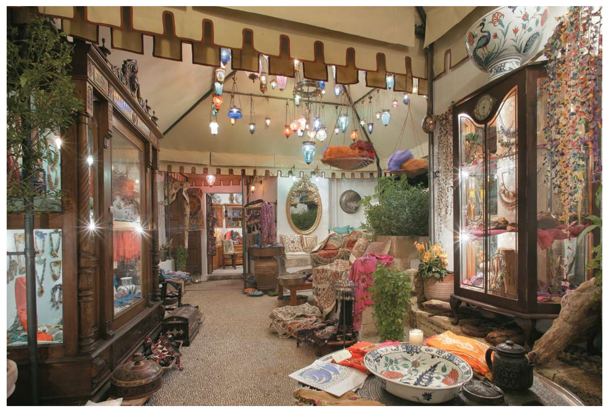
9 The adjoining shop, "Το ΦΟUΛΙ" ("Jasmine") is an exotic mini-bazaar.