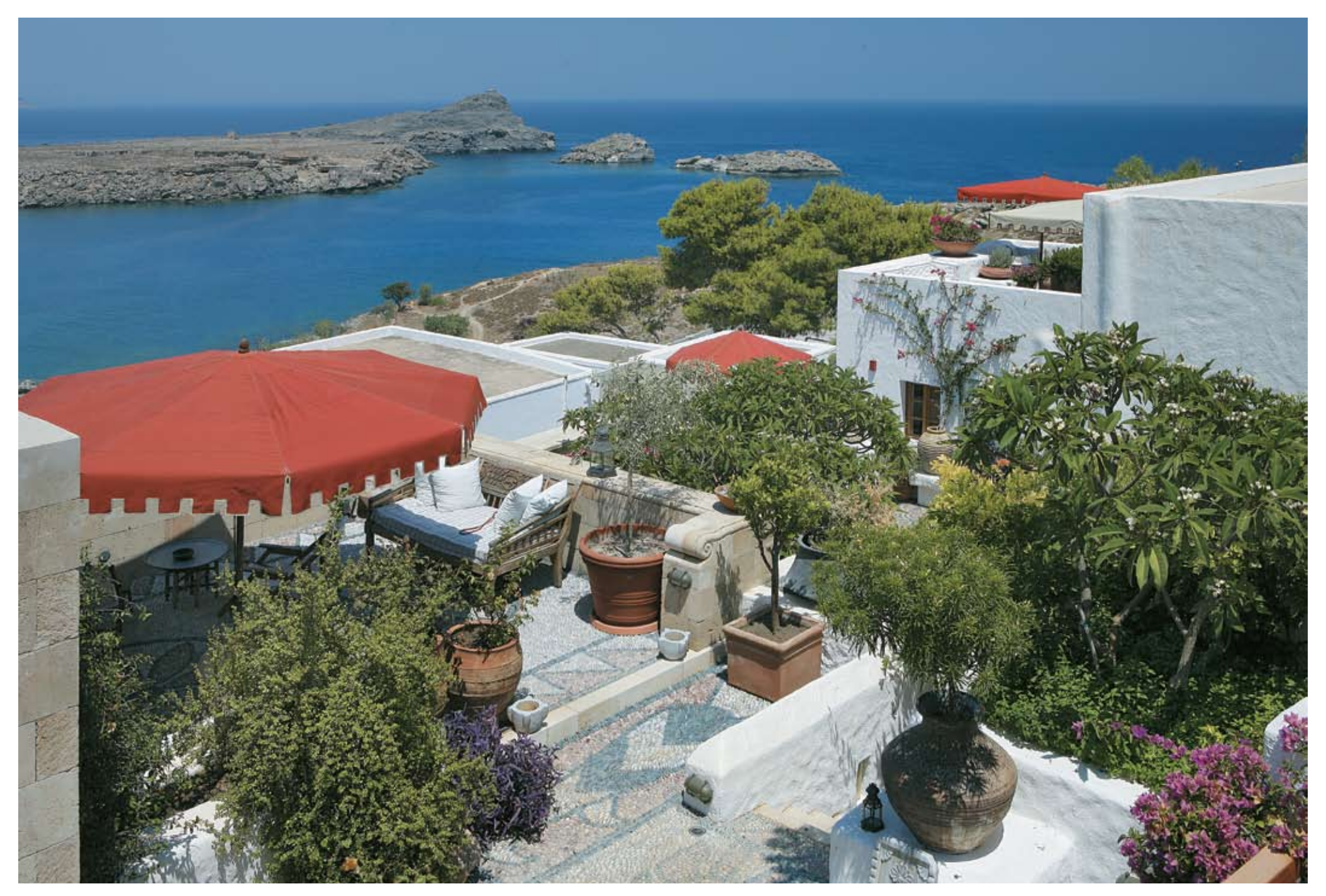
Following the Lindos tradition, the hotel's steps of locally quarried sandstone define terraces paved with mosaics of pebbles.