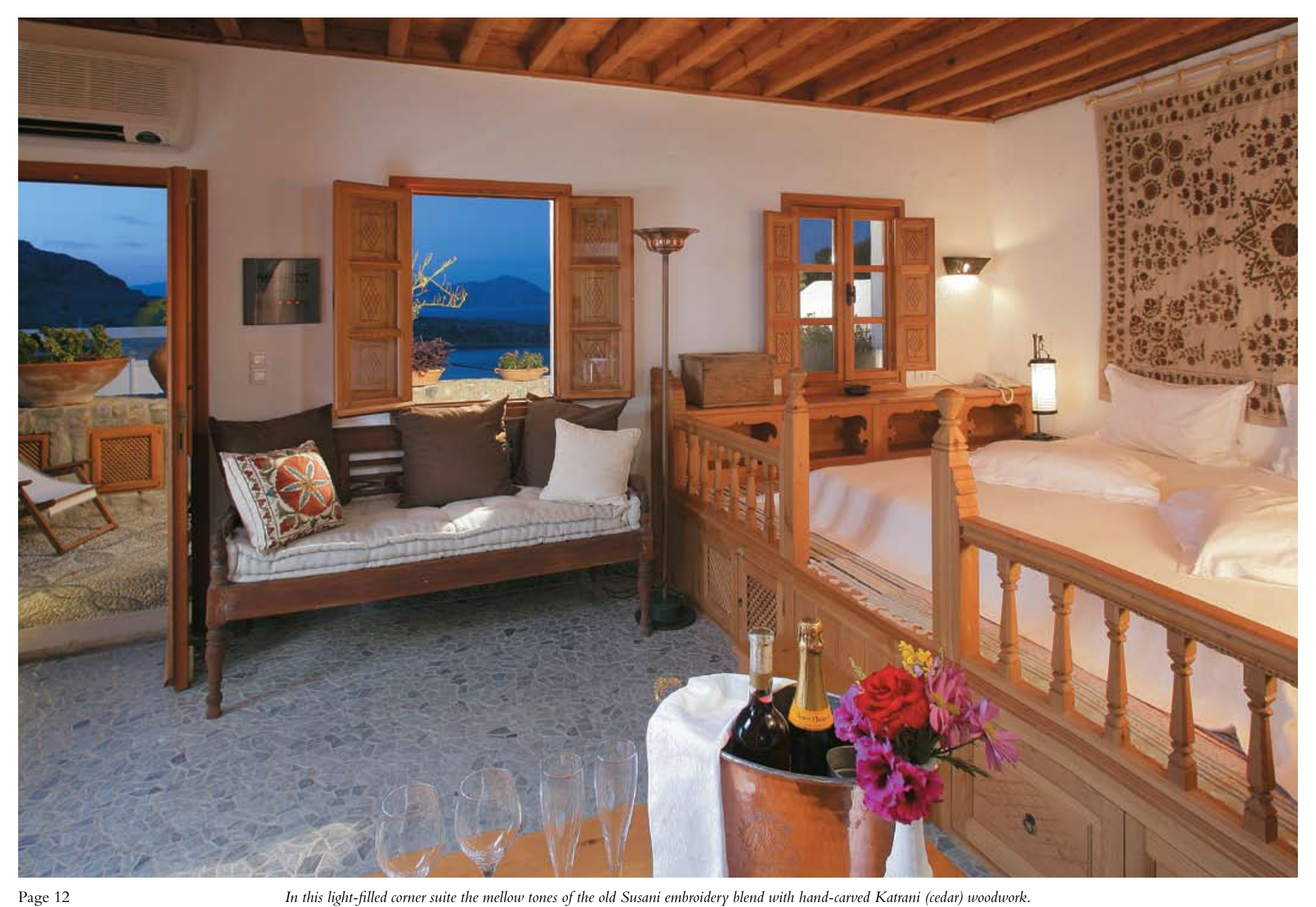
In this light-filled corner suite the mellow tones of the old Susani embroidery blend with hand-carved Katrani (cedar) woodwork.